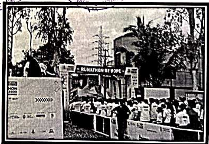
Students all set for the marathon