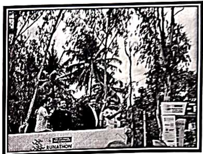
Director sir cheering up the students