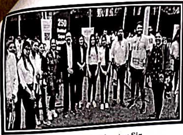
Students with Hon. Director Sir