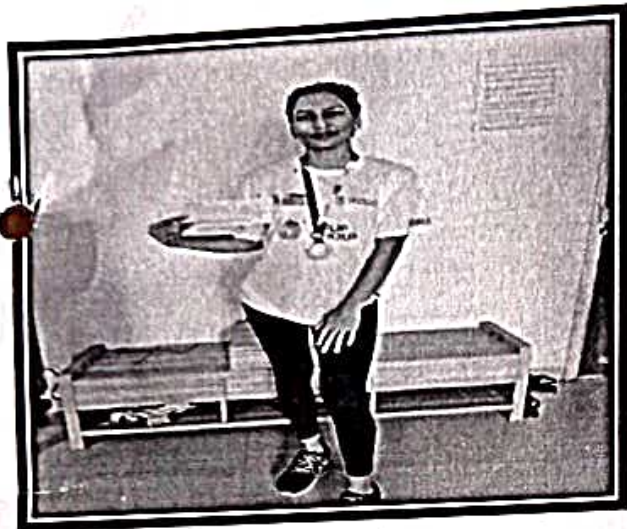
Winner of 5 kms marathon