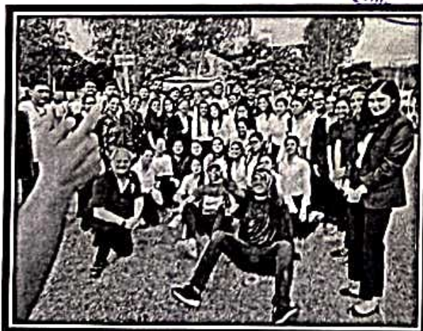
Students with Rotary club Volunteer