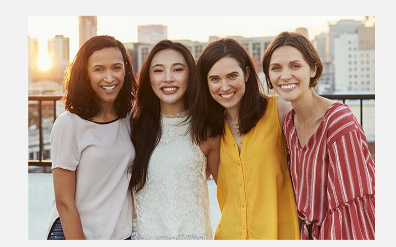
Target Audience Profile