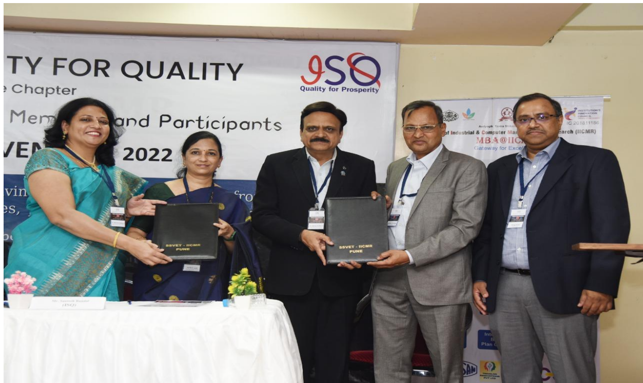
Signing MOU with ISQ